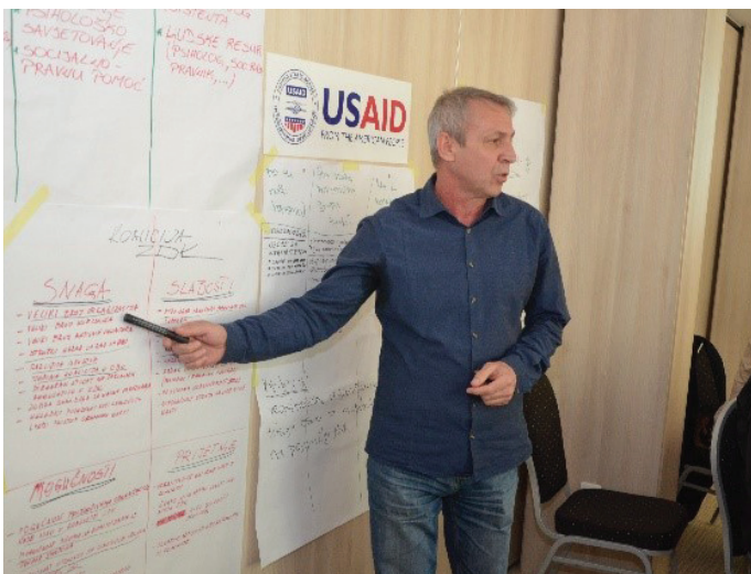
Participants presenting working in groups

During the second day of the training, special attention was accorded to the importance of analyses and their role in developing strategic plans. During group work, and with the trainer's help, the participants defined key questions for the development of the organization, and set strategic focal points and goals.